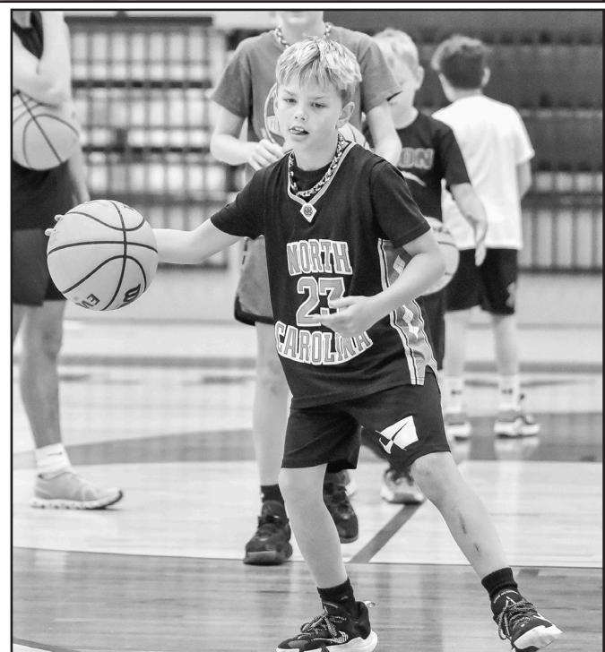
The Union County Panthers basketball team hosted a three-day boys' youth basketball camp from June 23-25. The event attracted more than 20 up-and-coming local basketball players to the UCHS gymnasium for shooting, passing and ball handling drills, along with games, food and lots of fun.