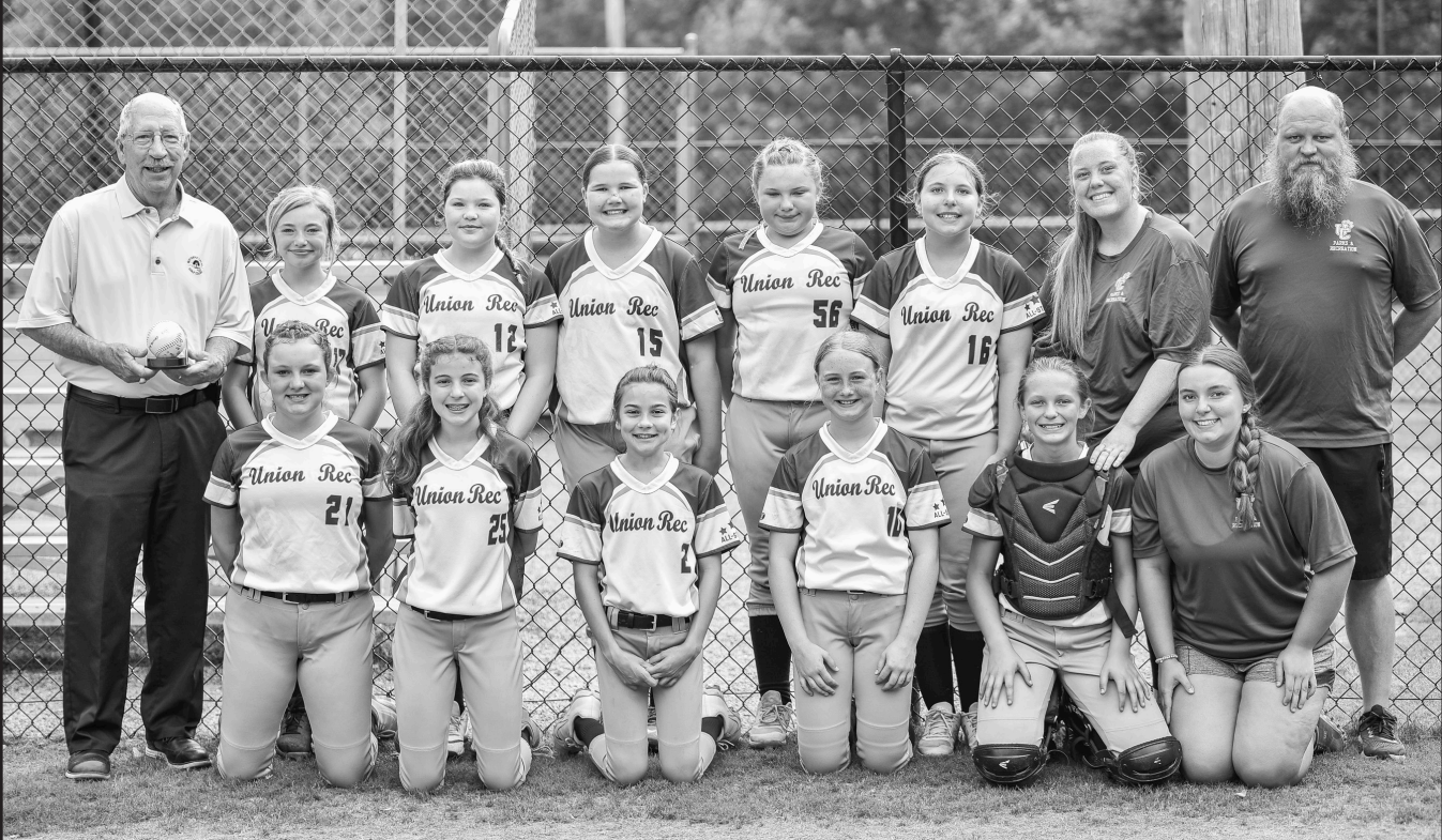
Alongside the Union County 12U softball team, Union County Sole Commissioner Lamar Paris (standing - left) dealt the ceremonial first pitch ahead of Union County Recreation Department's 12U softball tournament on June 13 at Meeks Park.